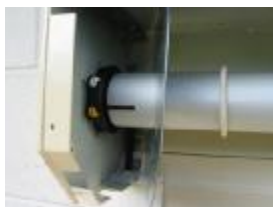
SOMFY electric motor on left side of roller shutter

At the motor end of the Roller Shutter you will see a Yellow and a White button. These are to set the stop position of the Roller Shutter at the fully open and fully closed position.