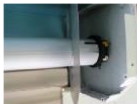
SOMFY electric motor on right side of roller shutter.

White button is to set the down limit, the yellow button is to set the upper limit. Yellow button is to set the down limit, the white button is to set the upper limit.